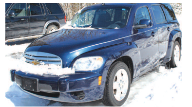
2010 CHEVY HHR Only 60,000 miles AS LOW AS $249 A MONTH TO QUALIFIED BUYERS