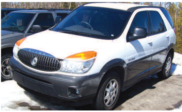
2001 BUICK RENDEZVOUS Air, cruise, loaded. Very nice. BUY FOR JUST $6,995