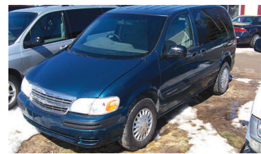
2004 CHEVY VENTURE VAN Only 65K, 24 MPG, 7 pass., air, cruise BUY FOR JUST $6,995