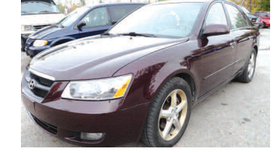
2006 HYUNDAI SONATA 30 MPG! Power everything. Nice Car! BUY FOR $10,900 OR PAYMENTS AS LOW AS $269 A MONTH TO QUALIFIED BUYERS