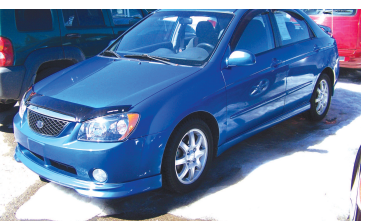
2006 KIA SPECTRA Power sunroof, air, cruise, great MPG. BUY FOR JUST $5,995!