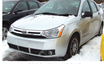
2011 FORD FOCUS Auto, cruise, air. Great MPG! BUY FOR $11,495 OR PAYMENTS AS LOW AS $169 A MONTH TO QUALIFIED BUYERS