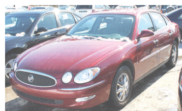
2007 BUICK LACROSSE Buick quality at a low price. $9,900 S LOW AS $199 A MONTH TO QUALIFIED BUYERS