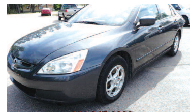
2003 HONDA ACCORD LX 33 MPG! FWD, air, cruise, lots more. BUY FOR $7,900 OR PAYMENTS AS LOW AS $249 A MONTH TO QUALIFIED BUYERS