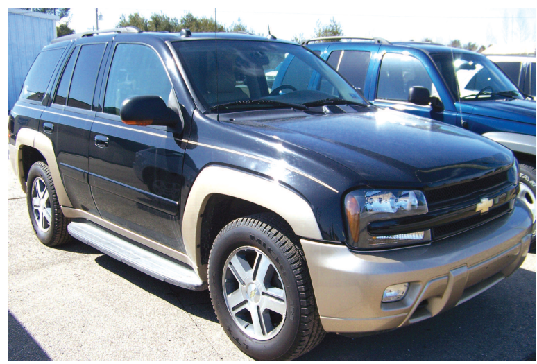
2005 CHEVY TRAILBLAZER 4WD, two tone, tow pkg, leather & loaded PURCHASE FOR ONLY $9,495!