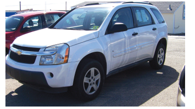
2007 CHEVY EQUINOX AWD, air, cruise and more. BUY FOR JUST $8,995!