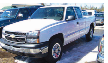
2006 CHEVY SILVERADO 1500 4x4, 4 dr., ext. cab, 8 cyl, tow pkg. Nice BUY FOR JUST $11,995