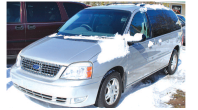
2005 FORD FREESTAR 7 passenger, loaded. $7,995 AS LOW AS $179 A MONTH TO QUALIFIED BUYERS