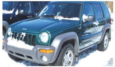
2003 JEEP LIBERTY 4x4. Power sunroof, 100K AS LOW AS $249 A MONTH TO QUALIFIED BUYERS