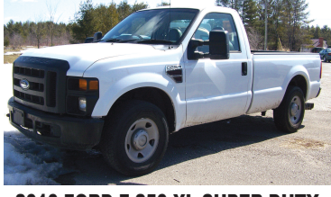
2010 FORD F-250 XL SUPER DUTY Diesel, bedliner, leather. $12,900 AS LOW AS $199 A MONTH TO QUALIFIED BUYERS