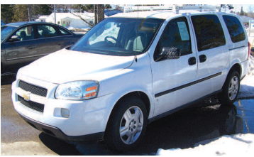
2008 CHEVY UPLANDER CARGO VAN Cargo cage, lock console, roof rack BUY FOR JUST $8,995