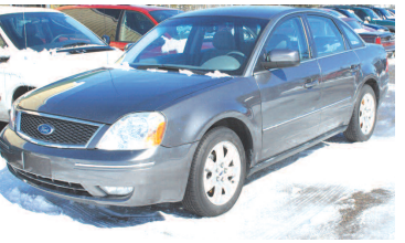
2006 FORD 500 Very clean. AS LOW AS $249 A MONTH TO QUALIFIED BUYERS