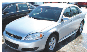
2010 CHEVY IMPALA LT Loaded, 29 MPG. $12,900 AS LOW AS $199 A MONTH TO QUALIFIED BUYERS